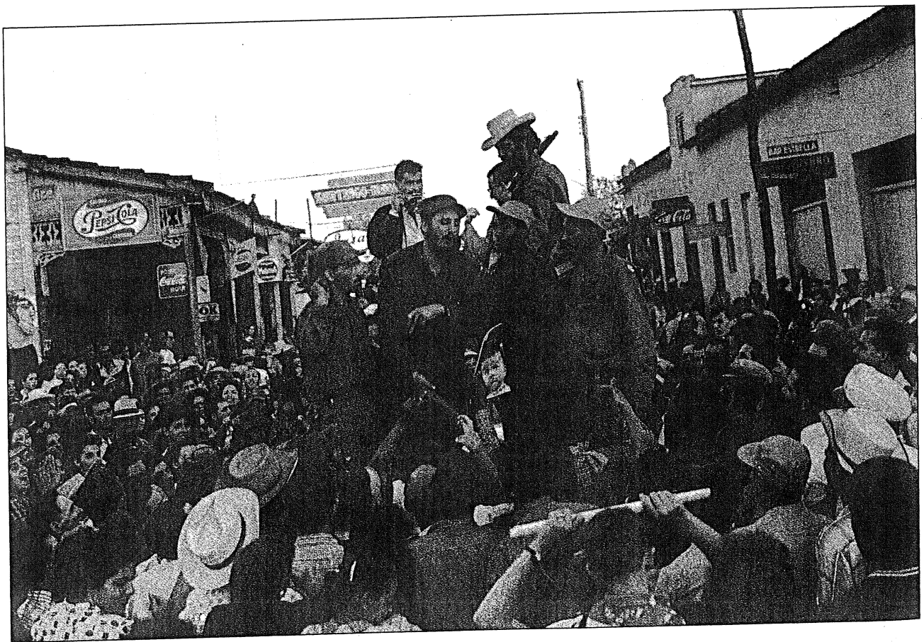
Fidel Castro talking to a crowd of supporters in 1959.

Although Cuba was a tiny island, its location meant that it was seen as strategically important by the empires that colonised the Americas – the British and Spanish. The Spanish built forts all over the island and maintained an army of mercenaries to control the population and defend its colony. In fact, Britain did make a failed attempt to seize control of Cuba in 1763.